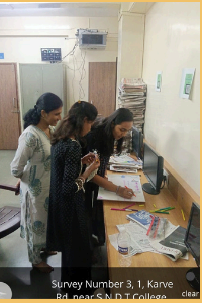
Survey Number 3, 1, Karve Rd. near S.N.D.T. College clear