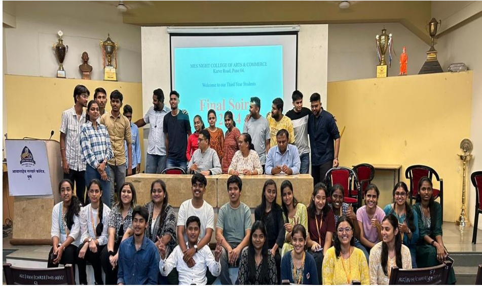
Farewell Program for TYBcom Student's (Batch 2023-24)