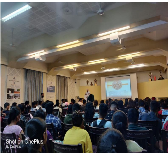
Students & Staff during Principal Address

Engaged and eager to learn, the students actively participated in the event, gaining valuable insights into the college's resources and academic structure. This informative and welcoming program marked a successful beginning to the academic journey of F.Y.B.Com Students at MES Night College of Arts & Commerce.