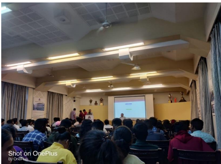
Students & Staff attending the session